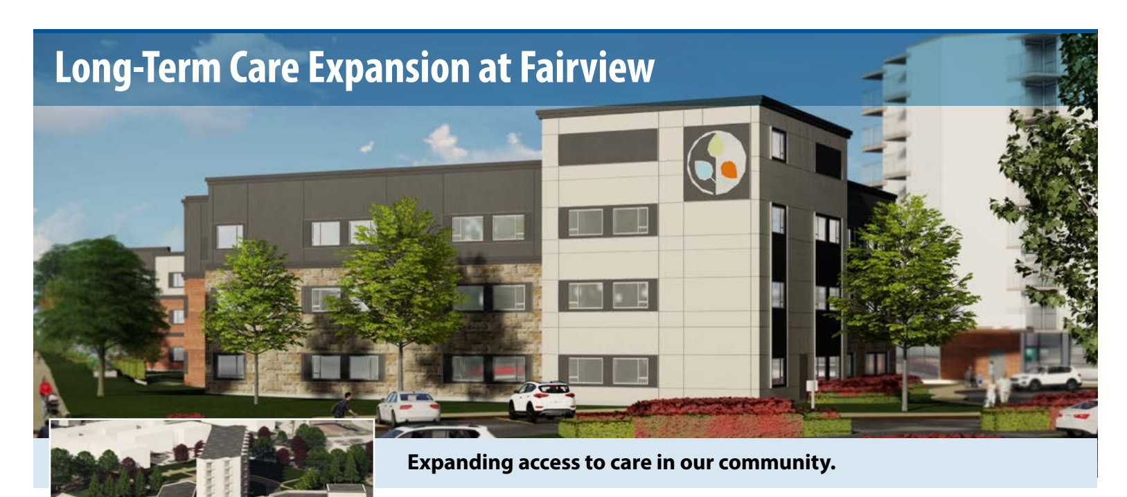
Architectural renderings of Fairview Long-Term Care home expansion.

In December 2022, the Ministry of Long-Term Care announced funding incentives based on