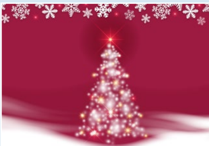
How to Give: Year End Giving 2023