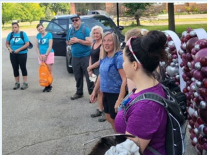
A Year in Review