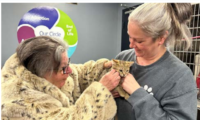
Giving Back. Fairview LTC residents collected donations of supplies for Cambridge & District Humane Society Shelter and received a few furry cuddles in return.