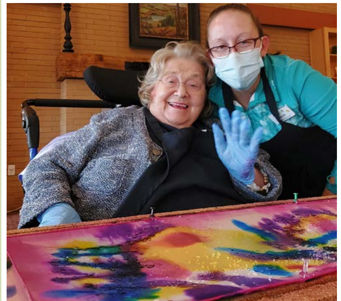
Fun making silk scarves at Parkwood.

Community groups and programs are in full swing! Fairview and Parkwood Residents are gathering to craft, garden, paint, pet, listen, learn, chat, exercise, play, volunteer, worship and enjoy delicious treats on special occasions.