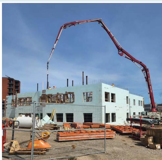
Construction of the second storey of the Long-Term Care Home’s new East Wing.

For more information or to donate, please email: capitalcampaign@fairviewmh.com .