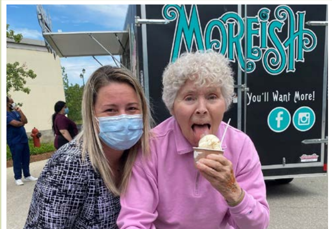
A beautiful day to enjoy some ice cream and music outside at Parkwood!